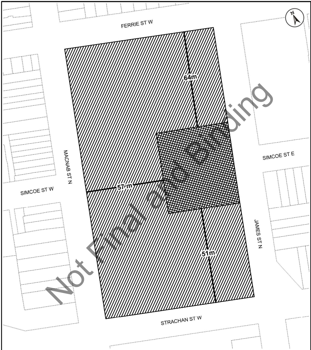
Special Figure 29: 405 James Street North