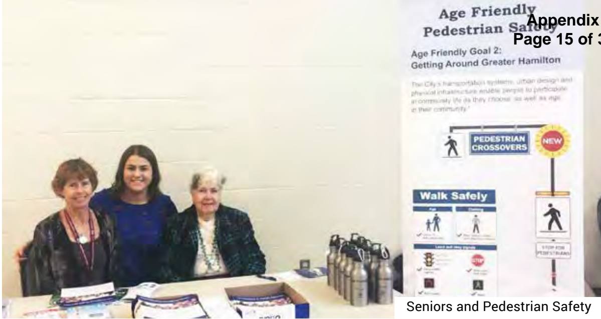
Seniors and Pedestrian Safety