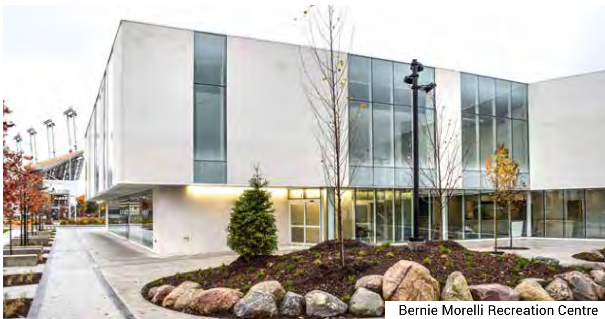
Bernie Morelli Recreation Centre