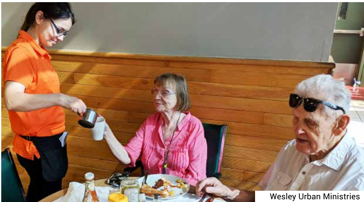
Wesley Urban Ministries