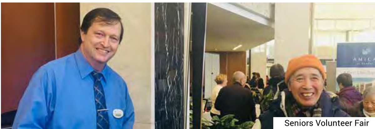
Seniors Volunteer Fair