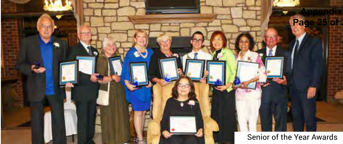
Senior of the Year Awards