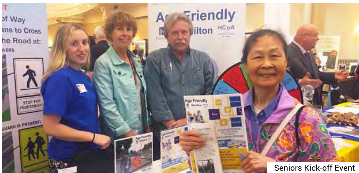
Seniors Kick-off Event