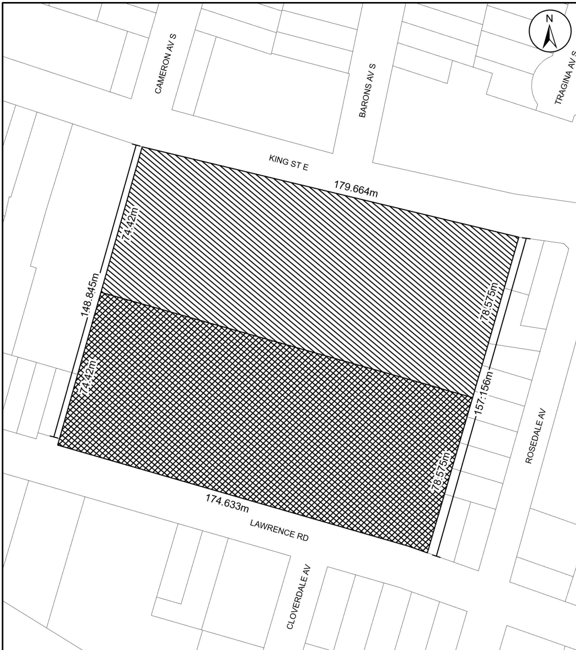
Special Figure 31: Maximum Building Setbacks for 1842 King Street East