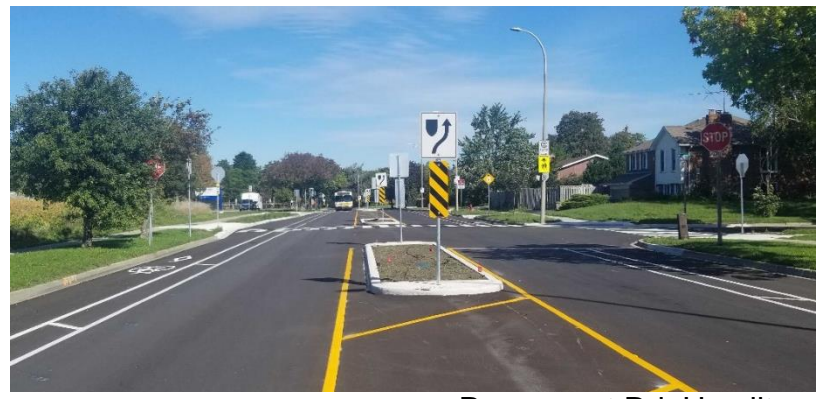
Paramount Rd, Hamilton Buffered bicycle lanes