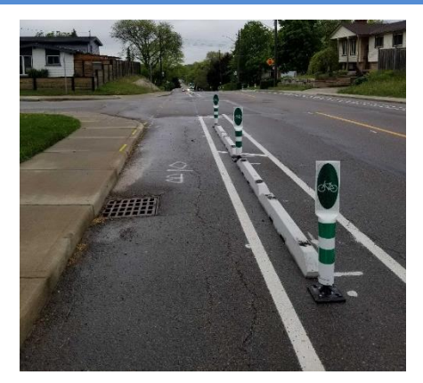
Upper Paradise Rd, Hamilton Buffered bicycle lanes with barriers