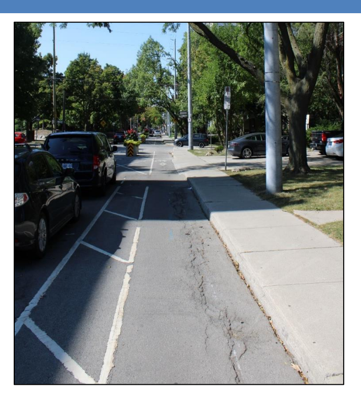
Herkimer Ave, Hamilton Parking protected bicycle lane as planned on Young St