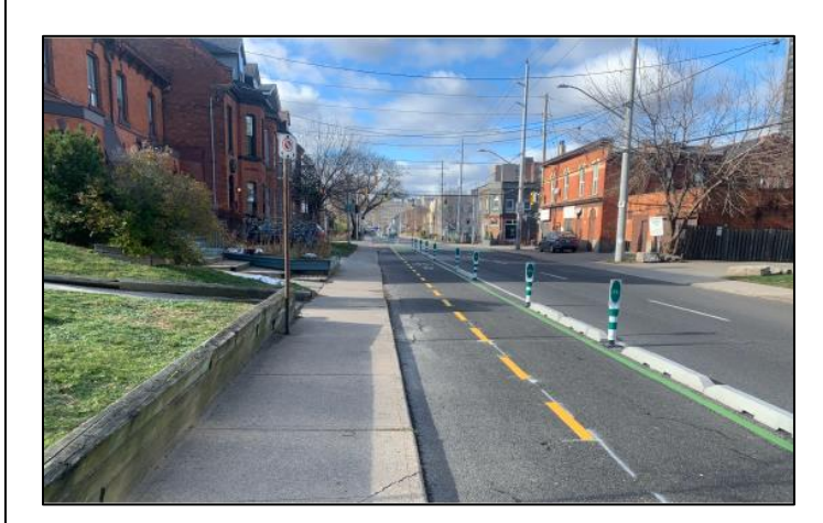
Hunter St, Hamilton Two-way cycle track with precast curbs and flexposts