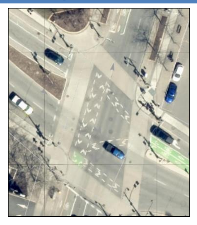
Bay St @ York Blvd, Hamilton Special turning box in intersection