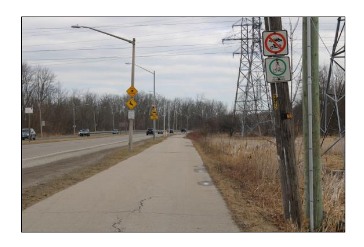
Cootes Dr, Dundas Multi-use path