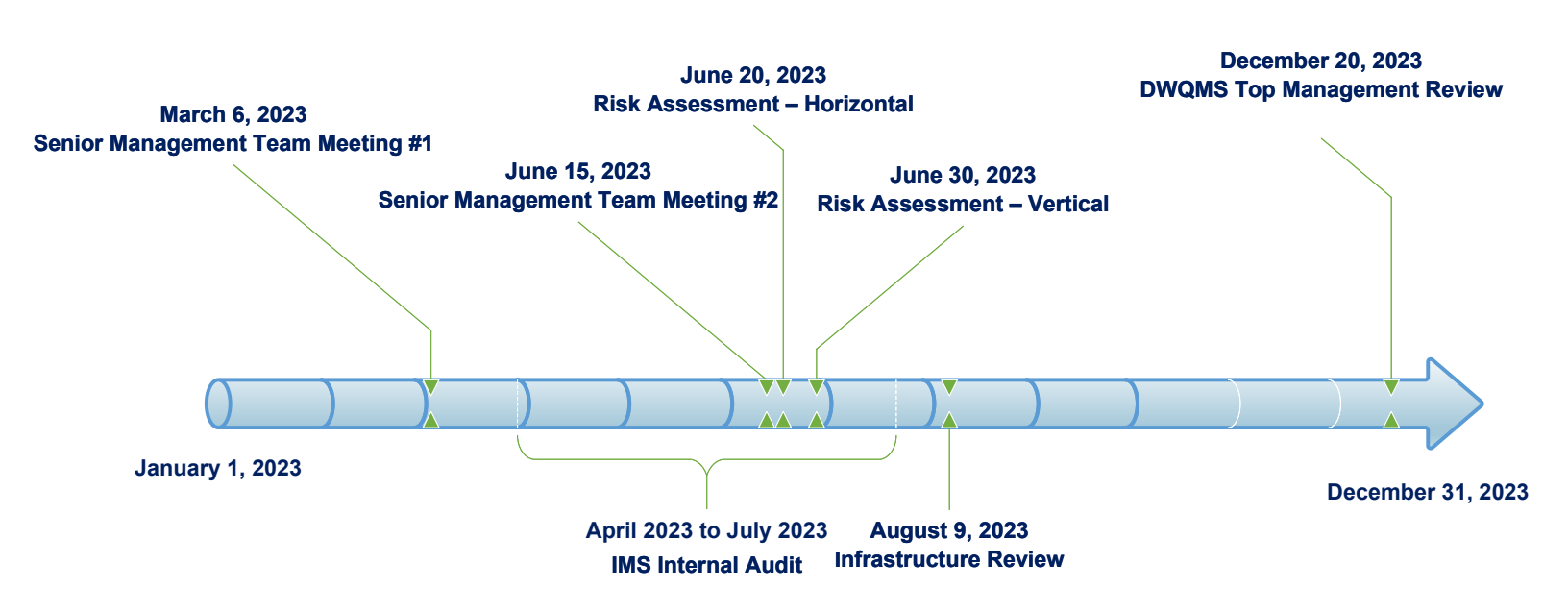
FIGURE 1: PROJECT PIPELINE - 2023 (KEY DWQMS MILESTONES WHICH OCCURRED IN 2023)